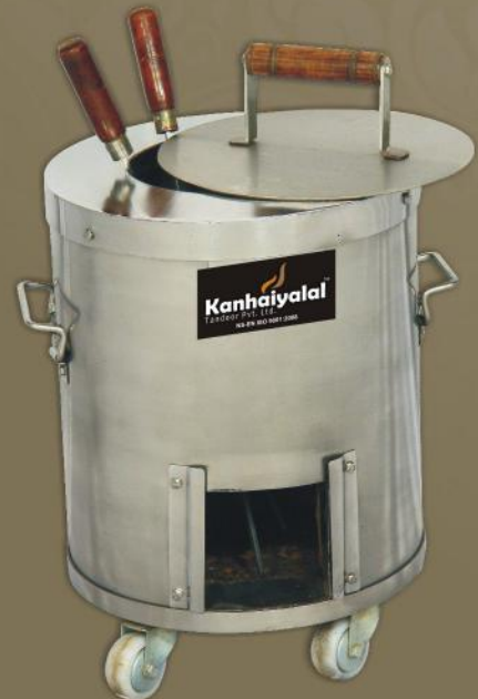
SS Home Tandoor