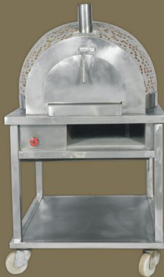
Mosaic Design Fired Pizza Oven Size 40" x 40" x 55"