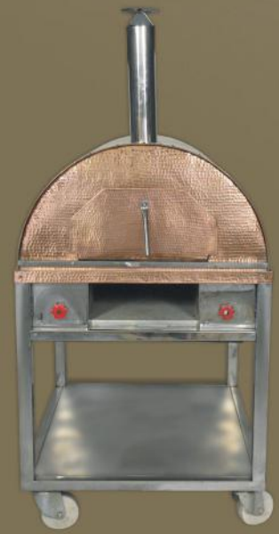
Copper Gas Fired Pizza Oven Size 36" x 40" - 60"

Our Range Of Products Can Be Availed In Different Capacities & Designs And Can Be Customized As Well To Meet The Clients Requirements.