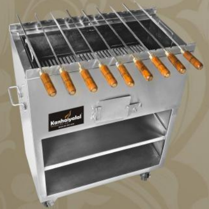
SS BBQ With Hood

Length : 34" Width : 15" Height with Trolley & Hood : 65" Height with Trolley : 41" Weight (Approx. In Kg) : 80