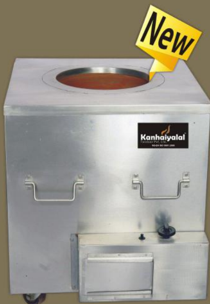
SS Electric Tandoor