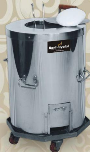
SS Round Tandoor