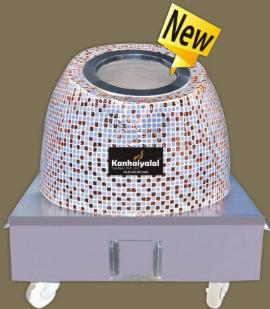
Mosaic Tiles Tandoor