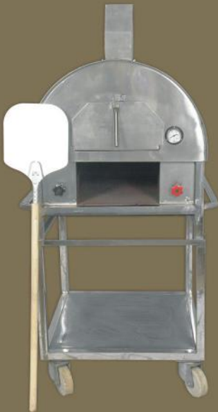
SS Gas Fired Pizza Oven Size 32" x 32" x 65"