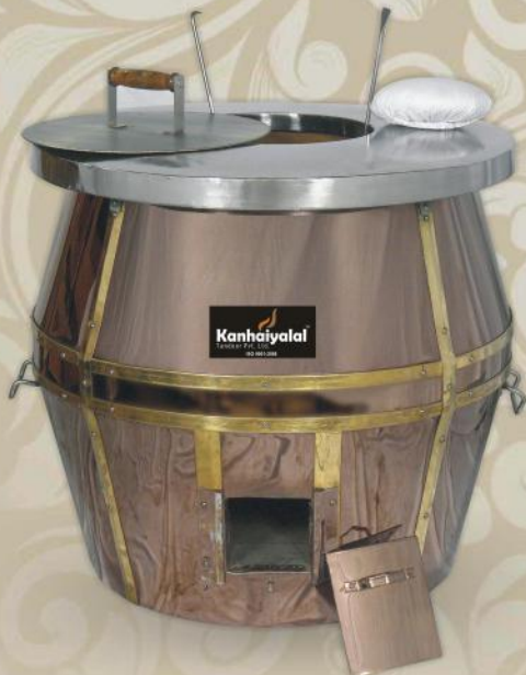
Rose Gold Tandoor