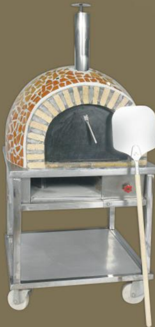
Mosaic Design Gas Fired Pizza Oven Size 40" x 40" x 55"