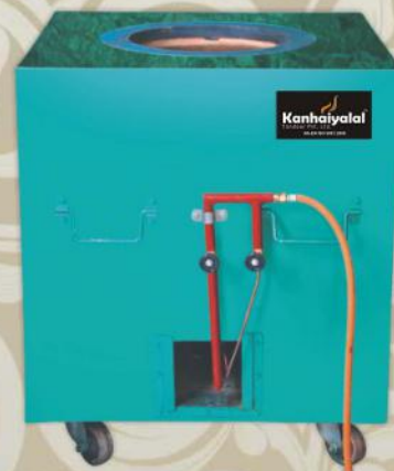
MS Tandoor with Gas System