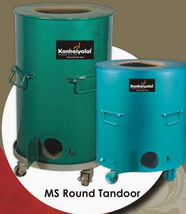
MS Round Tandoor

A clay pot is fitted in a MS / SS Barrel of 18 gauges in a plain design with 3 ss straps tied round its top, center and bottom for reinforcement along with a provision of ash outlet. 4 Handles (collapsible type) are provided lifting, pushing and pulling. The pot inside the barrel is duly insulated with thermal insulations, glass wool, instant use type with 4 swivel castors at the bottom to make it mobile.