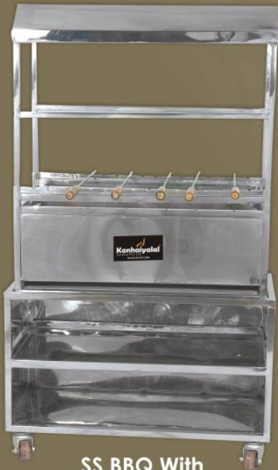
SS BBQ With Hood & Trolley

Moveable, trolley, with 4 universal wheels. Full S/S material, easy to clean. Can be used in any outdoor environment.