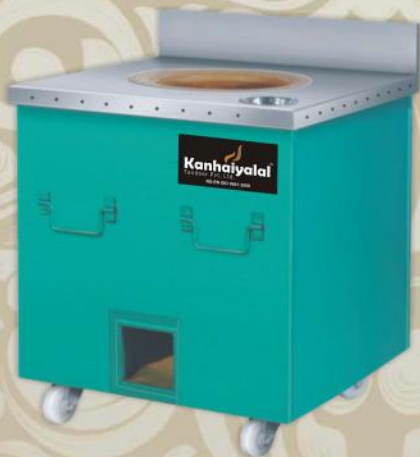
MS Tandoor with Steel Top